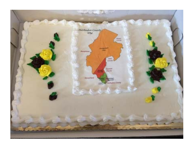
helped to serve cake and hot chocolate.

photos. Click on a photo to see a larger image of it. Thanks to all the Rotarians that