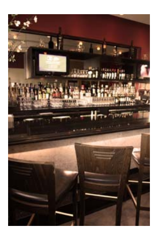
Special 5th Wedenesday Offsite COCKTAIL HOUR at GALLO ROSSO Bar & Restaurant Wed, April 30, 2014 5pm to 6:30pm

The Rotary Club of Flemington will be holding a special offsite cocktail hour on 4/30, which is the 5th Wednesday of April.