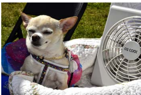
PHOTO ALBUM from the 2014 Bark in the Park DOG WALK