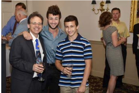
PHOTO ALBUM from the 2014 Changing of the Guard Dinner Held on Wed, June 25, 2014 Copper Hill Country Club

Click Here or on the photo to the left to view the Photo Album from the recent Changing of the Guard Dinner.