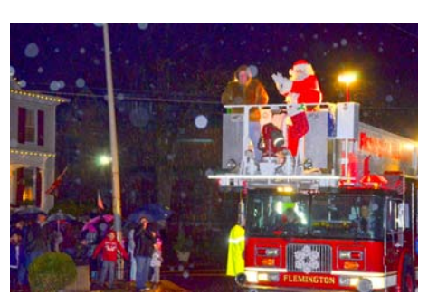
PHOTO ALBUM from the Main Street Christmas Tree Lighting Ceremony Held on Friday, December 5, 2014

<u>Click Here</u> or on the photo to the left to view the Photo Album from the recent Tree Lighting Ceremony.