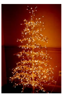
PHOTO ALBUM from the Rotary Holiday Party Held on Wed, December 3, 2014

A special thanks to Herb Bohler as well for taking the photos and generating the Picasa photo album.