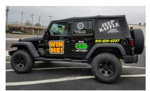
Click Photo to see a larger image

Joint Effort by the Hunterdon County Rotary Clubs: The Soup Cook-Off event is organized and run as a joint effort by the Rotary Clubs of Flemington, Clinton Sunrise, North Hunterdon, Lambertville-New Hope, Whitehouse and the Hunterdon Horizon eClub.