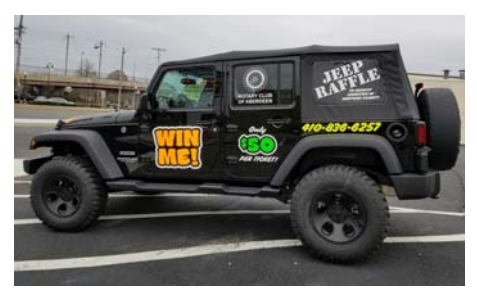
Click Photo to see a larger image