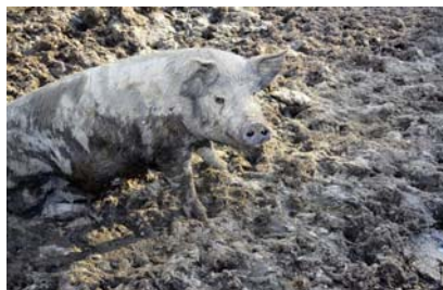
PHOTO ALBUM from the Evening Dinner and Farm Tour at Stonybrook Meadows Farm Held on Wed, May 25, 2016

This coming Friday is the first Friday of the month. If you can spare some time, the unloading of the Flemington Area Food Pantry truck delivery will occur at their location across the parking lot from the entrance to the Flemington Wal-Mart at 8:45am.