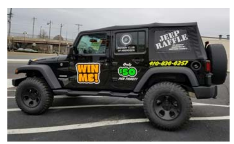
Click Photo to see a larger image

Joint Effort by the Hunterdon County Rotary Clubs: The Soup Cook-Off event is organized and run as a joint effort by the Rotary Clubs of Flemington, Clinton Sunrise, North Hunterdon, Lambertville-New Hope, Whitehouse and the Hunterdon Horizon eClub.