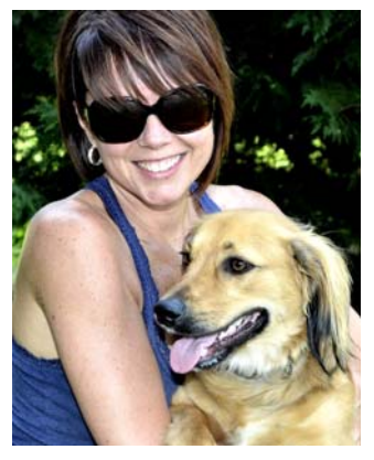
8th Annual Rotary BARK IN THE PARK DOG WALK