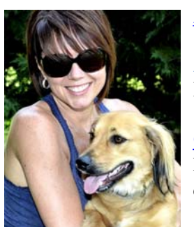
PHOTO ALBUM from the 8th Annual BARK in the PARK Dog Walk Event Held on Sunday, June 12, 2016

past Sunday's Dog Walk event in the near future.