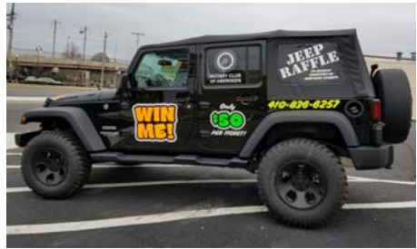
Click Photo to see a larger image

Joint Effort by the Hunterdon County Rotary Clubs: The Soup Cook-Off event is organized and run as a joint effort by the Rotary Clubs of Flemington, Clinton Sunrise, North Hunterdon, Lambertville-New Hope, Whitehouse and the Hunterdon Horizon eClub.