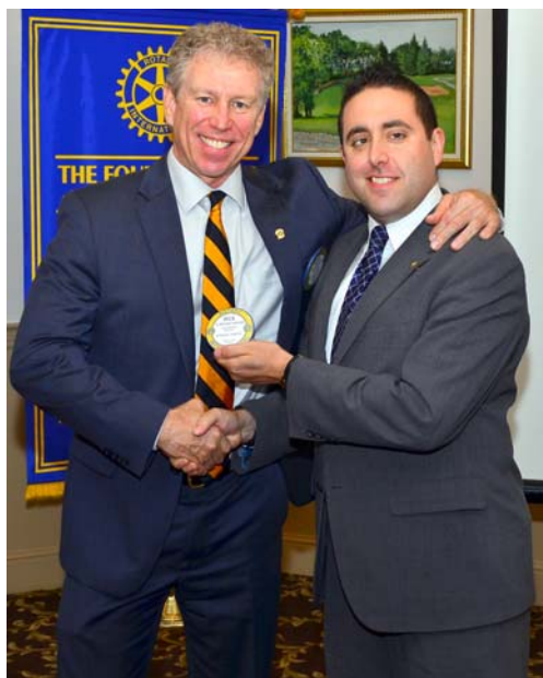
PHOTO ALBUM from the 2016 Changing of the Guard Dinner Held on Wed, June 22, 2016 Copper Hill Country Club

Click Here to view the Photo Album from the recent Changing of the Guard Dinner.