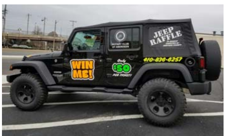
Click Photo to see a larger image

The program for tomorrow's meeting will be Club Assembly .