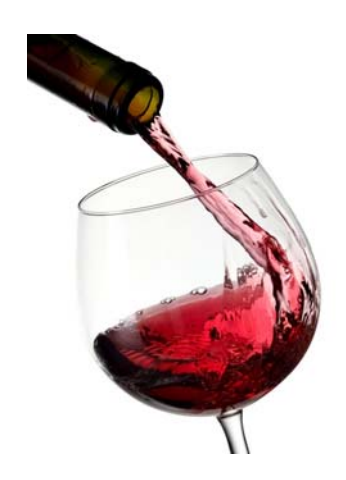
Rotary Club of Princeton 2nd Annual WINE TASTING EVENT

September 13, 2016 Hopewell Valley Vineyards 46 Yard Road - Pennington, NJ $75 per Person