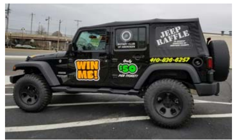
Click Photo to see a larger image

CLICK HERE to download and view a PDF of Michelle's presentation on Workplace Readiness.