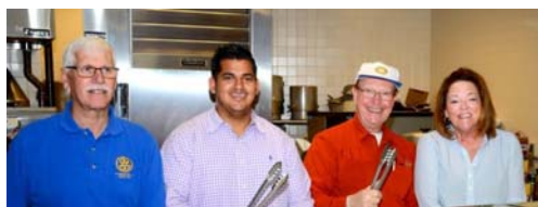
PHOTO ALBUM from the 42nd Annual PANCAKE DAY plus COSTUME CONTEST and Halloween High School