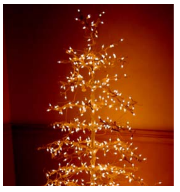
Flemington Rotary's Annual HOLIDAY COCKTAIL PARTY Thursday, December 1 Time: 6:00 PM to 8:00 PM Al Fresco's