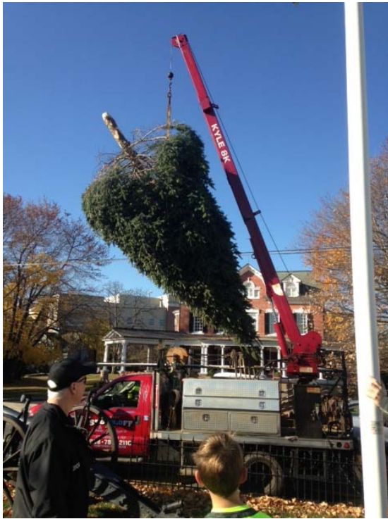
PHOTO ALBUM of the 2016 Main Street Christmas Tree Cutting & Installation Saturday, November 19