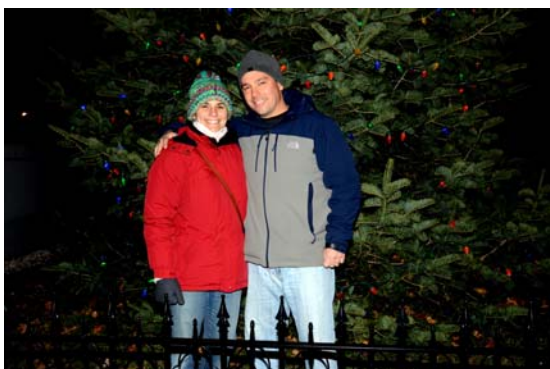
PHOTO ALBUM from the Main Street Christmas Tree Lighting Ceremony Held on Friday, December 2, 2016