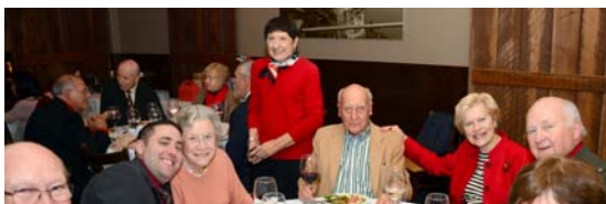
PHOTO ALBUM from the Flemington Rotary Holiday Party

Wed, 1/25 : OFFSITE Meeting at the Hunterdon County Polytech Career Cafe