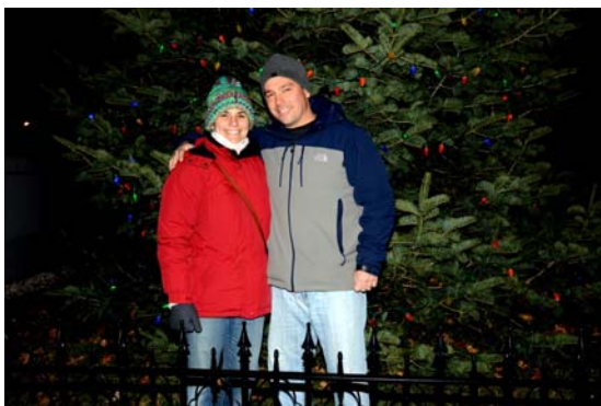
PHOTO ALBUM from the Main Street Christmas Tree Lighting Ceremony Held on Friday, December 2, 2016