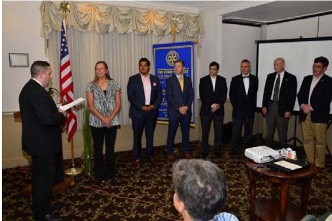
PHOTO ALBUM from the 2017 Changing of the Guard Dinner