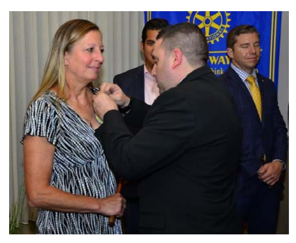
CHANGING of the GUARD DINNER Follow-Up Held on Wed, June 28, 2017 at the Copper Hill Country Club

http://www.signupgenius.com/go/10c0c4aa8a823a7ff2-sprintin