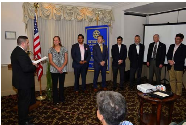
PHOTO ALBUM from the 2017 Changing of the Guard Dinner Held on Wed, June 28, 2017 Copper Hill Country Club

Click Here to view the Photo Album from the recent Changing of the Guard Dinner.