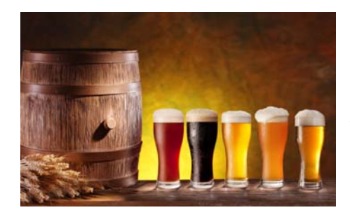
Flemington Rotary BeerFest Update on Breweries On Board to Date Current As of 9/19/2017

We wanted to share the final list of Brewing Companies attending the BeerFest. Click Here to view the list of breweries, cideries plus distillery that are on board to date to attend the Flemington