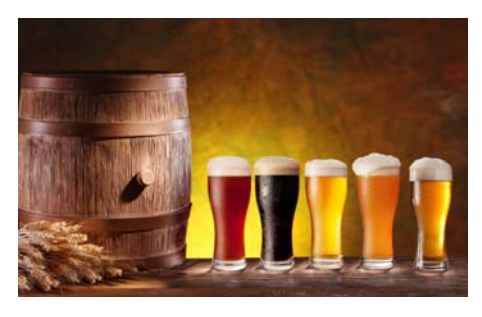
Flemington Rotary BeerFest Final List of Tasting Booths For the Sat, 10/14 Event

Sponsorship Opportunities! We hope you will consider sponsoring the event! Click Here to download the Sponsor Registration Form , which includes an explanation of the different sponsor levels.