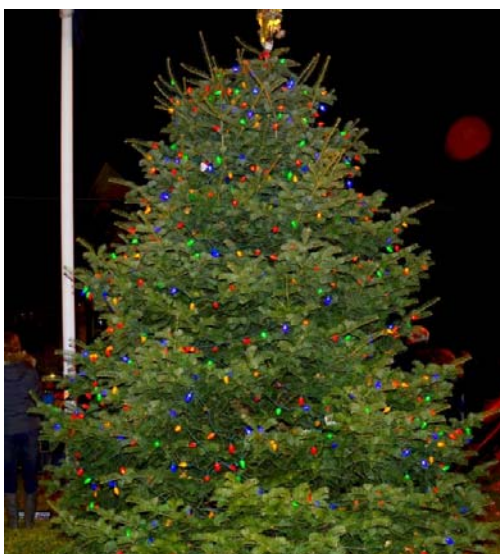
PHOTO ALBUM from the Main Street Christmas Tree Lighting Ceremony