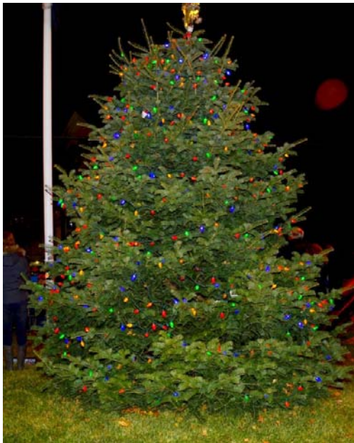
PHOTO ALBUM from the Main Street Christmas Tree Lighting Ceremony Held on Friday, December 1, 2017

Click Here or on the photo to the left to view the Photo Album from the recent Tree Lighting Ceremony and After-Party.