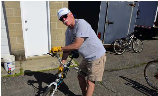
PHOTO ALBUM from the 2018 Pedals for Progress Collection