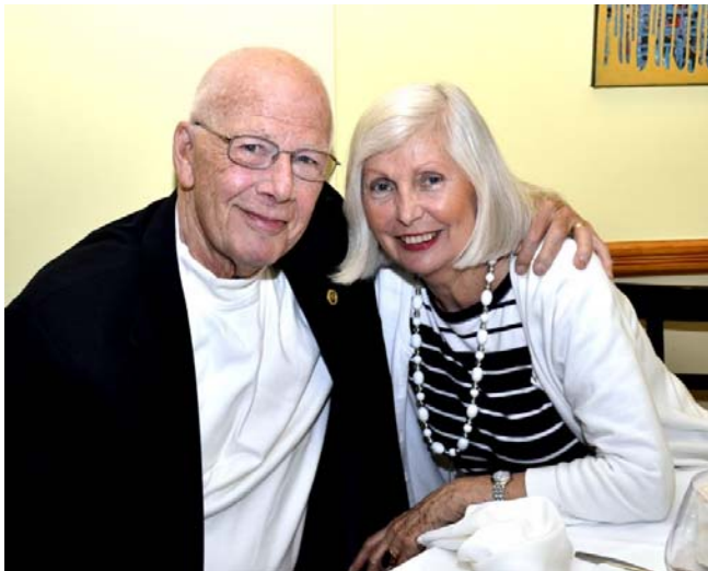
PHOTO ALBUM from the 2018 Changing of the Guard Dinner