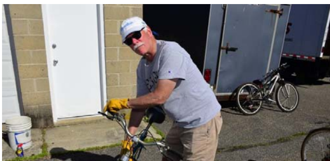
PHOTO ALBUM from the 2018 Pedals for Progress Collection