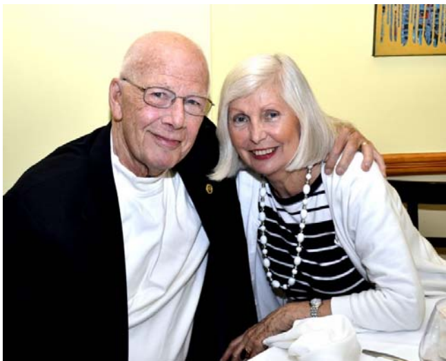
PHOTO ALBUM from the 2018 Changing of the Guard Dinner