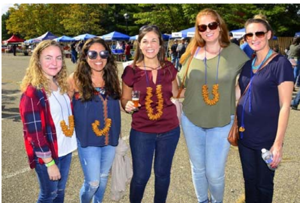
PHOTO ALBUM from the 2nd Flemington Rotary BeerFest Held, Saturday, 9/29/2018