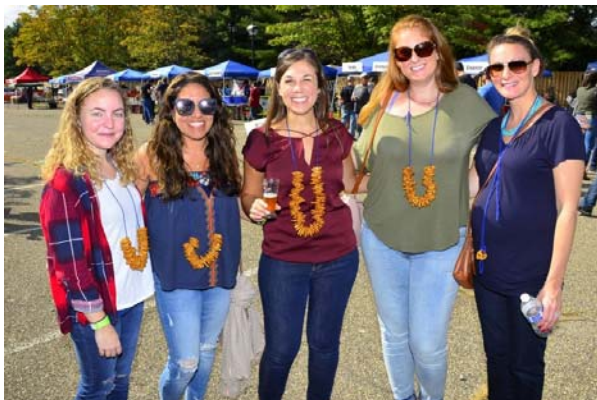
PHOTO ALBUM from the 2nd Flemington Rotary BeerFest Held, Saturday, 9/29/2018

Our 2nd BeerFest was an awesome event! The feedback from everyone that attended is that they loved the event. There are still invoices that we are waiting to receive, but a summary of how we did will be provided ASAP in the near future.