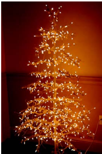
PHOTO ALBUM from the HOLIDAY COCKTAIL PARTY Held on Wed, December 12, 2018 at 55 Main Restaurant

The Wednesday, 12/26 club meeting has been canceled in lieu of the Holidays. Enjoy your time with family and friends!