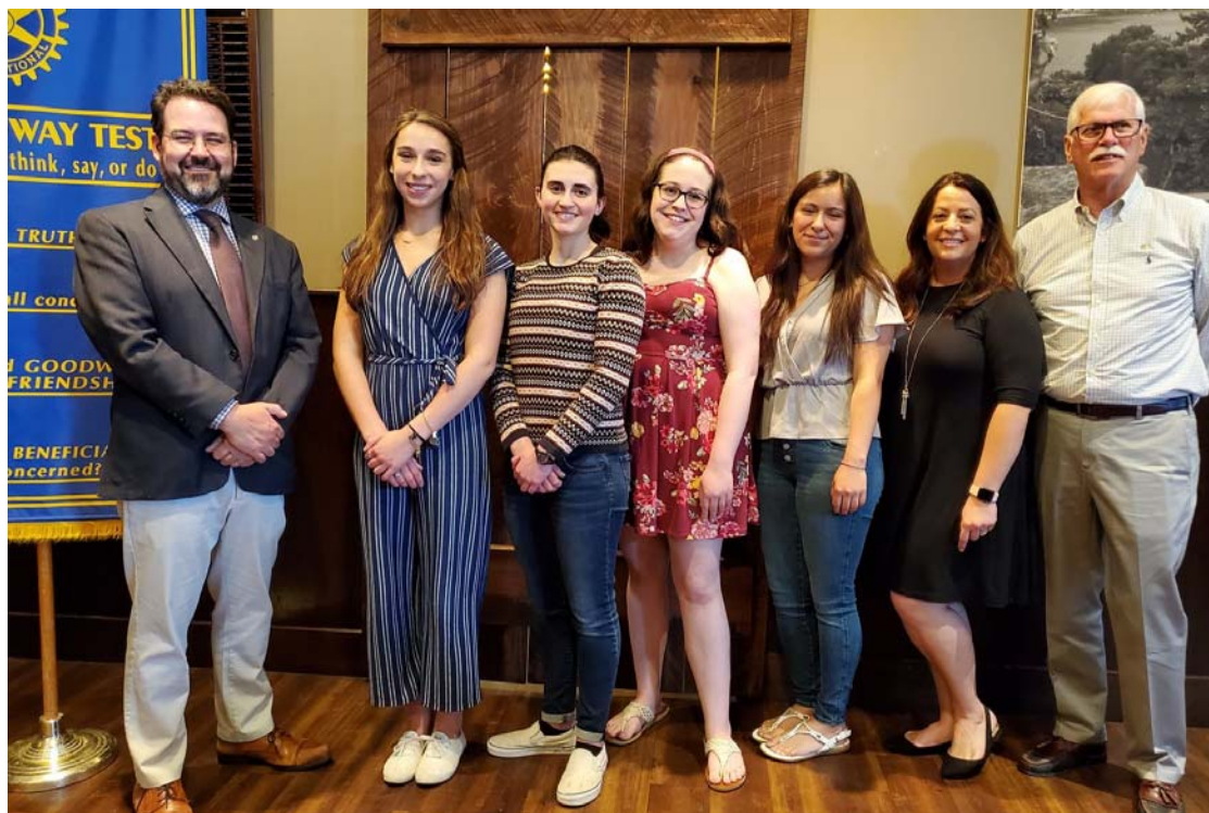
Photo of the 2019 Flemington Rotary Scholarship Recipients