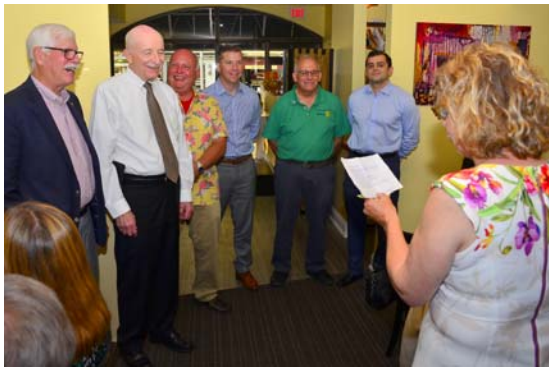
PHOTO ALBUM from the 2019 Changing of the Guard Dinner Held on Tues, June 25, 2019 55 Main Restaurant

Click Here to view the Photo Album from the recent Changing of the Guard Dinner.