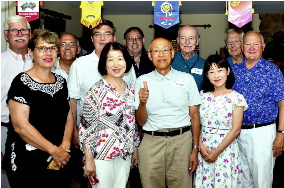
PHOTO ALBUM from the Informal Flemington Rotary Club Gathering Held, Saturday, 8/3/2019

Also, please plan to arrive early to the meeting as the meeting will promptly begin at 12:25 PM . The District Governor would like a full hour to speak.