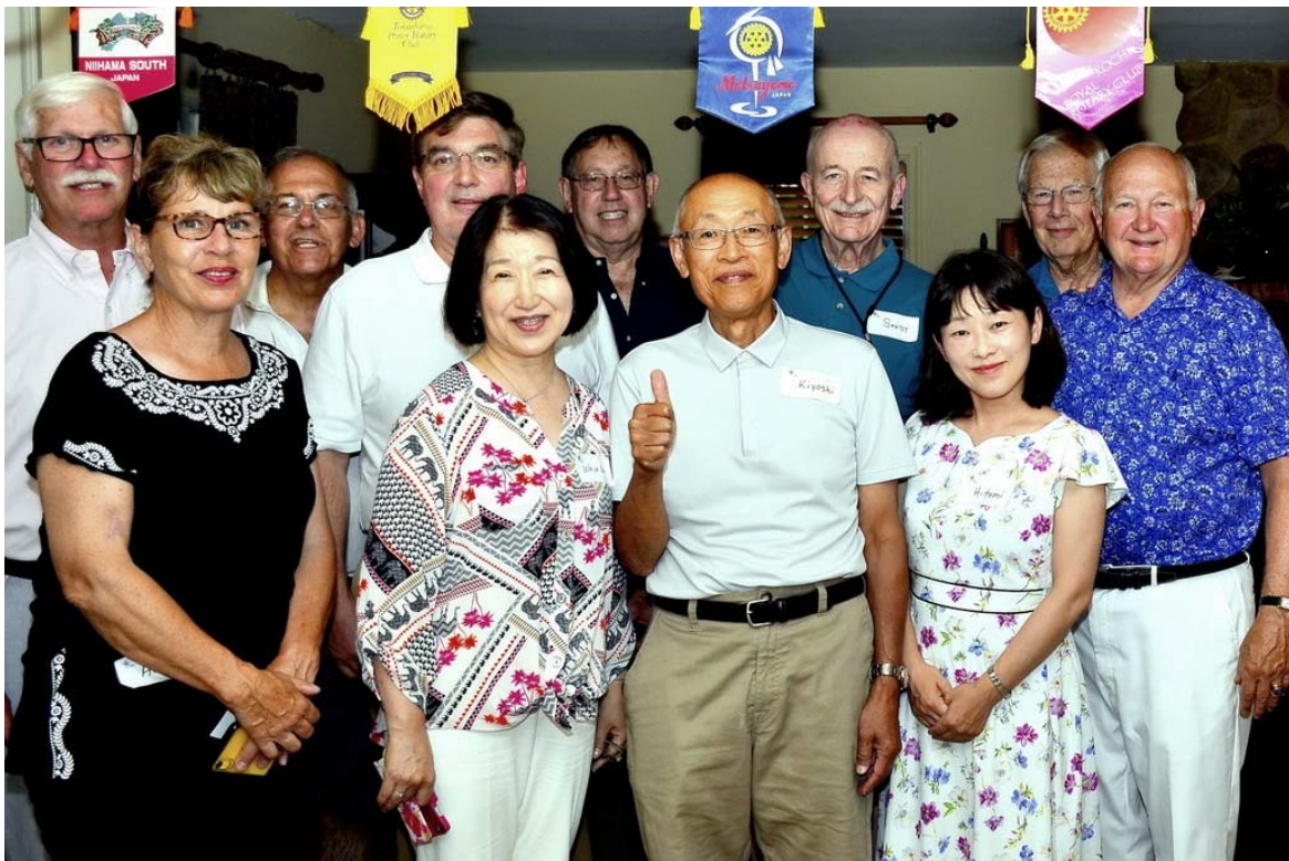
PHOTO ALBUM from the Informal Flemington Rotary Club Gathering Held, Saturday, 8/3/2019

Also, please plan to arrive early to the meeting as the meeting will promptly begin at 12:25 PM . The District Governor would like a full hour to speak.