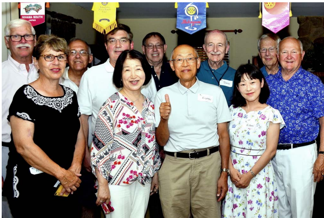
PHOTO ALBUM from the Informal Flemington Rotary Club Gathering Held, Saturday, 8/3/2019