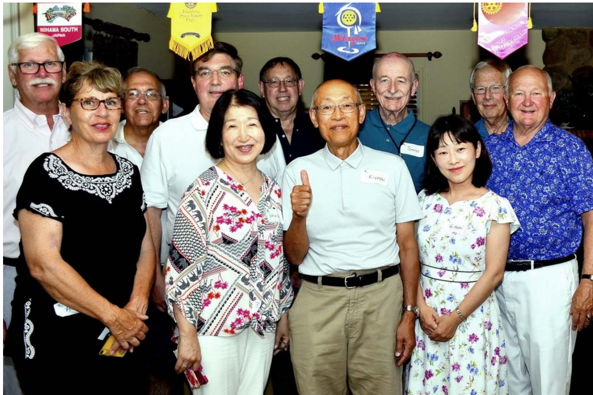
PHOTO ALBUM from the Informal Flemington Rotary Club Gathering