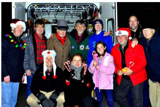
PHOTO ALBUM from the 2019 TREE LIGHTING CEREMONY Held, Friday, December 6, 2019

There was a Board Meeting held earlier this morning (Tuesday, 12/17) from 7:30 to 8:30am. It was held at the Shaker Cafe.