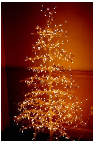
PHOTO ALBUM from the 2019 HOLIDAY PARTY Held, Wed, December 11, 2019

The Wednesday, January 1st club meeting has been canceled in observance of the Holidays. Enjoy your time with family & friends!