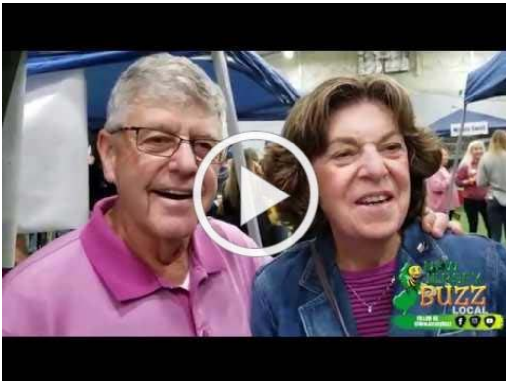
Flemington Rotary BeerFest + Christmas Tree Lighting Ceremony!!!

Either Click Here (or) click on the video image below in order to watch the video. Enjoy!