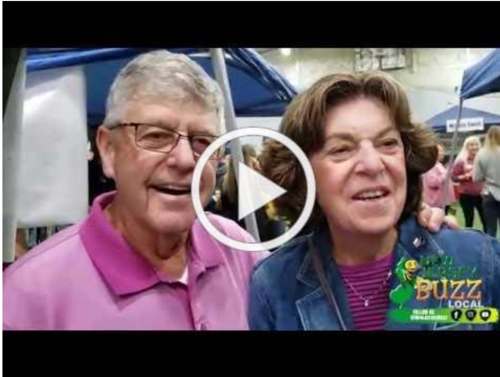
Flemington Rotary BeerFest + Christmas Tree Lighting Ceremony!!!

Either Click Here (or) click on the video image below in order to watch the video. Enjoy!