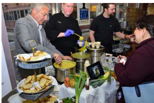
PHOTO ALBUM from the 2020 Hunterdon County Rotary SOUP COOK-OFF