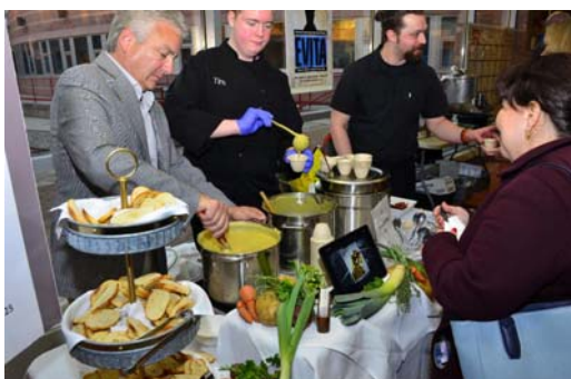
PHOTO ALBUM from the 2020 Hunterdon County Rotary SOUP COOK-OFF